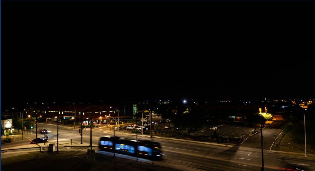
Tucson, Arizona, is lit by environmentally sensitive, modern lighting that saves energy.